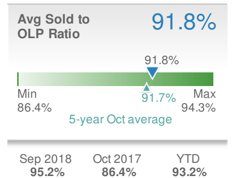
YTD Sep 2018 Oct 2017